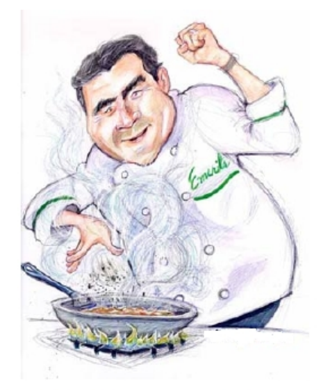
The Very Best of Emeril